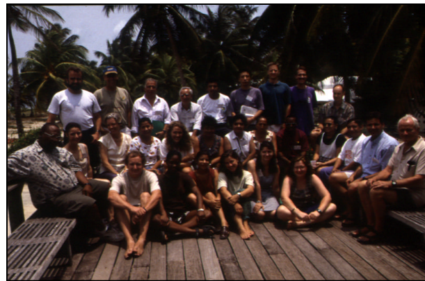
Participants of the Mesa Redonda II

A second Mesa Redonda El Pilar was convened to decide the issue. Held in Placencia, Belize, in 1998, the Mesa Redonda II (MR II) was the second of three international, multi-disciplinary workshops held as forums in which management strategies for the reserve are envisioned and devised. The clear accord between AdEP and