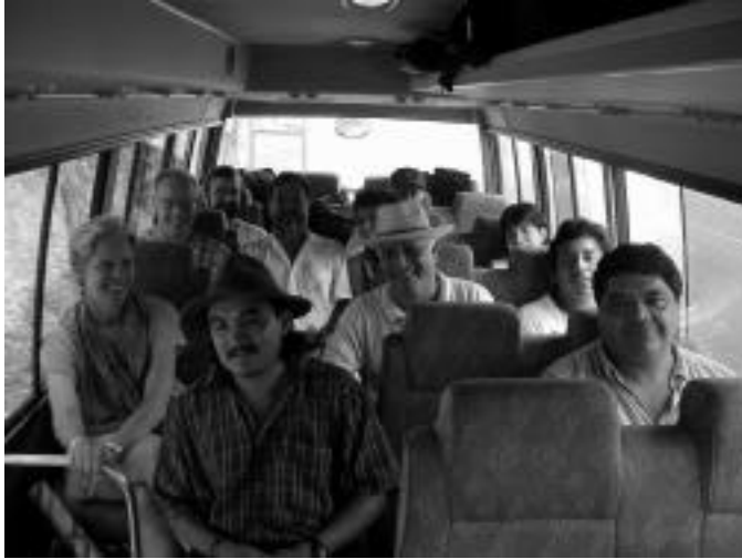
Traveling to the Mesa Redonda III El Pilar in Remate 2000