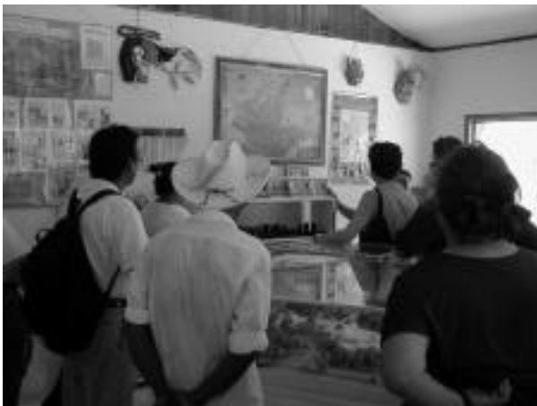
Ford Foundation visits the Be Pukte Cultural Center 2001