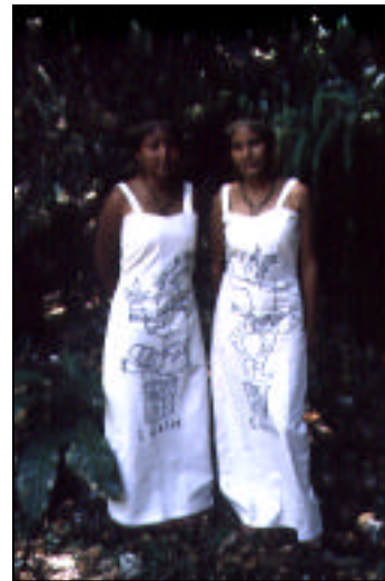
Las Reinas de El Pilar, 2001