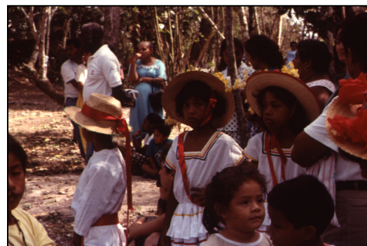
Dancers at Fiesta El Pilar, 1995