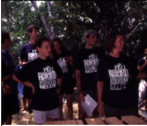
Raleigh International Volunteers

Participants of the Talleres visited six major archaeological sites in the Mundo Maya during the years of 1999-2000 to evaluate community and reserve strategies. The workshops demonstrated the different development options that community members have with regard to the formation of EPAR.