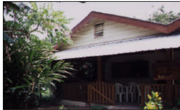
Be Pukte Cultural Center and Café in 2001

One obstacle to effective community participation that was identified by the UF team was the need to increase AdEP's linkages to other individuals and institutions. As the UF team concluded, the group had built important bridges within the community, with local NGO's, government agencies, neighboring communities, and in Guatemala. With Ford Foundation funds, regional program advocates were formally incorporated into the El Pilar Program. In Belize, Anselmo Castañeda, a natural resource conservationist with an agronomy background, focuses on local and regional environmental issues. In Guatemala, José Antonio Montes concentrates on legal and political processes. Castañeda's interest in ecological sustainability and Montes' appreciation of international law transformed the team from a grass-roots effort to the regional program that it has become today. This new dynamic infused AdEP with new internal organizational ability and external visibility.