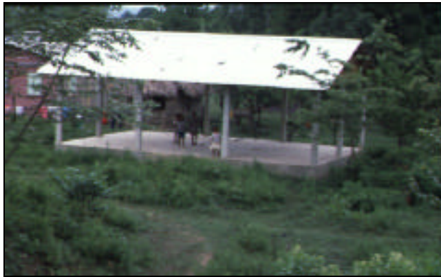
The AdEP Galleria after construction in 1995

the village community in short term and in long term dynamics remains a central theme in developing appropriate eco-tourism enterprises at El Pilar.