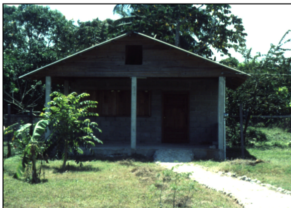
Be Pukte after initial construction in 1997

In 1998, AdEP's center, an underused concrete block construction was re-vamped, painted, and opened as the "Be Pukte Cultural Center." The Center received help from Global