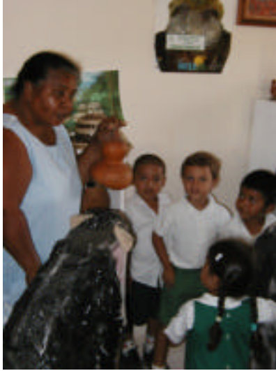
BTF students learn at Be Pukte

In 2001, PACT along with the Ford Foundation provided seed funds to strengthen El Pilar's collaboration with the two local schools. These funds helped the El Pilar teamwork with Sacred Heart Junior College (SHJC) to promote a program in eco-archaeological tourism and with the University Of Belize Faculty of Natural Resources (FNR) to introduce the forest-garden concept into their curricula.