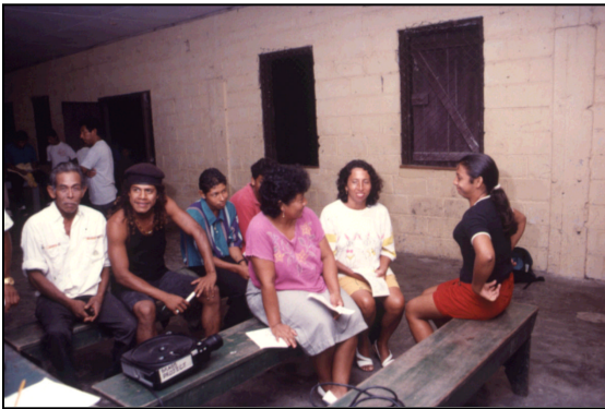
Early AdEP meeting in Bullet Tree Falls