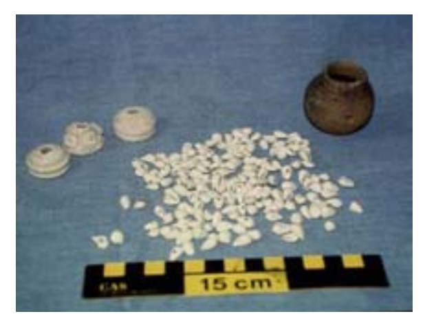
Artifacts from the Burial at Str. 5

Once again, outside of the beautiful intact architecture we did not find anything earthshaking but what we did find was exciting for everyone involved. The Tzunu'un crew is rightly proud of a small jar, three spindle whorls and a large quantity of small olive shells (they had been strung or sewn onto something) found in associated with the burial assemblage of Str. 5.