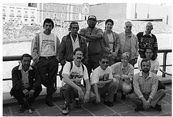
Participants visit the Plaza Mayor, Mexico

During the week of January 20-25 a group of 28 experts from Belize, Guatemala, Mexico and the United States met in Mexico City to help map out the future of the El Pilar Archaeological Reserve for Maya Flora and Fauna. Underwritten by the Ford Foundation, the meeting included representatives of the local villagers, archaeologists, government representatives, biologists, ecologists, community development planners, attorneys and conservators.