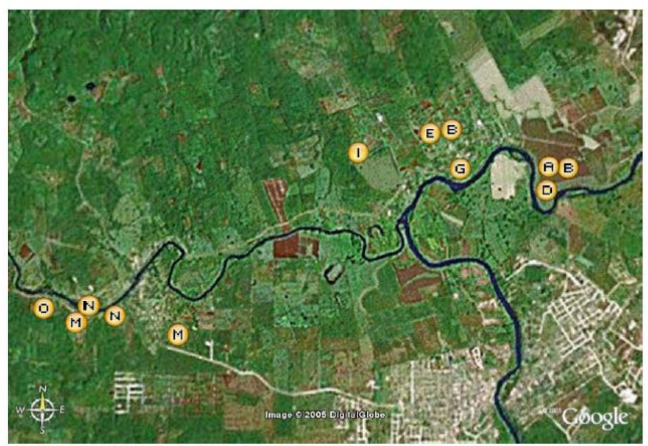
Figure 5: Selected town plots

This map below shows where the El Pilar Forest Garden Network home gardens are located. Each have distant outfields that they work periodically and where they maintain plants that are needed for roofing, construction, and fruits. They are a magnificent group of people and provide a window into how the Maya know the forest as a garden.